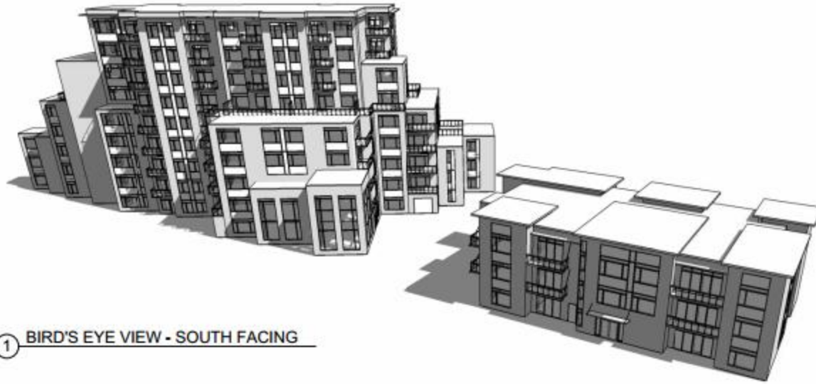
① BIRD'S EYE VIEW - SOUTH FACING