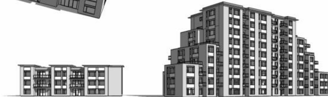
② STREET VIEW - NORTH FACING